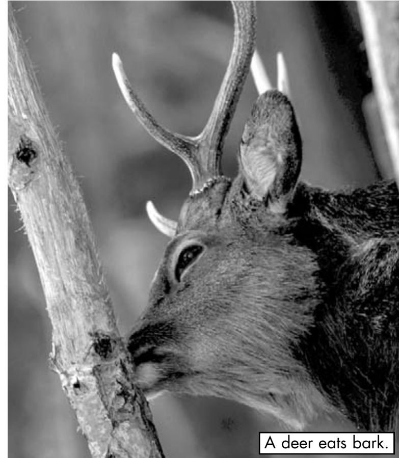
A deer eats bark.