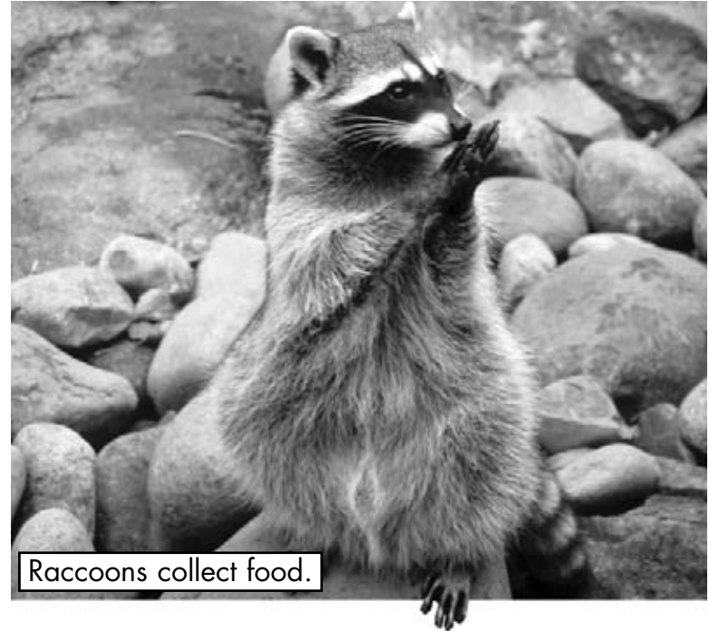
Raccoons collect food.

When an animal hibernates, its breathing slows down. Its heart beats more slowly. It does not need to eat.