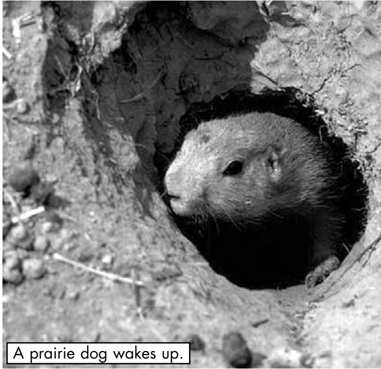
A prairie dog wakes up.

Some mice, squirrels, and bats hibernate all winter. Bears, raccoons, and skunks might wake up to eat on a warm winter day. In the spring, all the hibernating animals wake up.