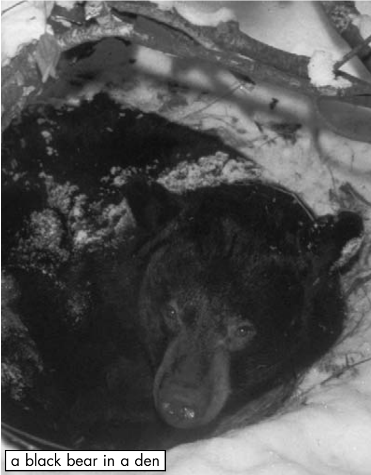
a black bear in a den

When an animal hibernates, its breathing slows down. Its heart beats more slowly. It does not need to eat.