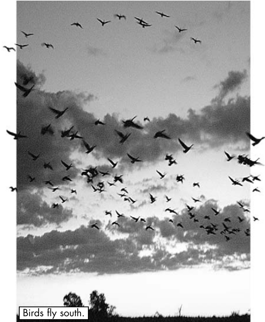
Birds fly south.

Some animals move to warmer places to find food. Other animals hibernate.